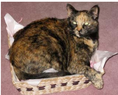
Super Cat Sundae takes over her Mom's gift basket.