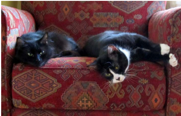
Olive & Marlowe (formerly Cher & Midnight)