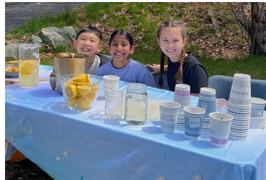
Two donations from lemonade stands