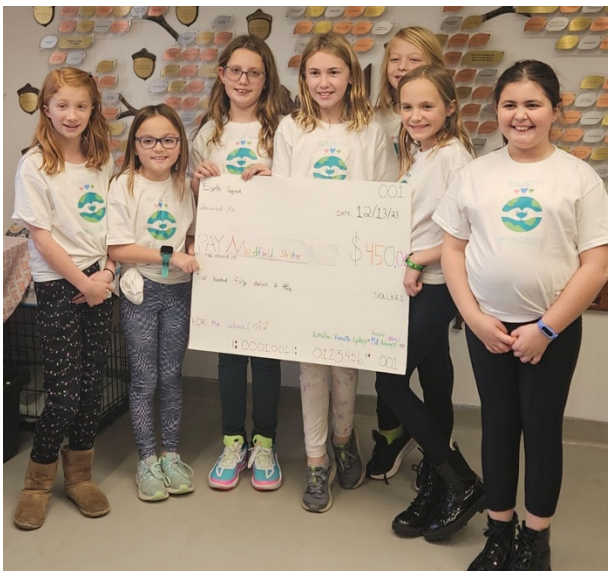
Earth Squad bake sale to benefit the Shelter