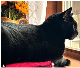
Ziggy (formerly Ozzie)