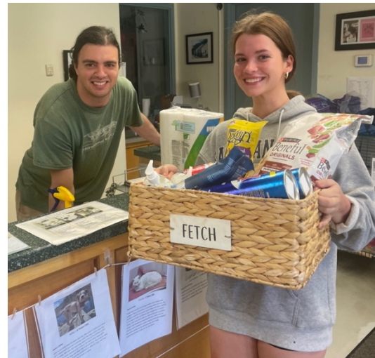
Millis High Senior Project