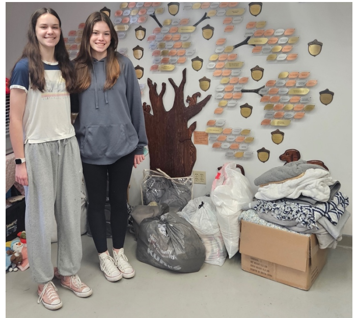
Holliston High Honor Society donations