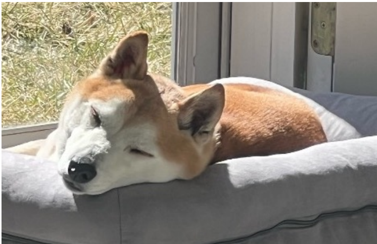
Skye enjoying the sun