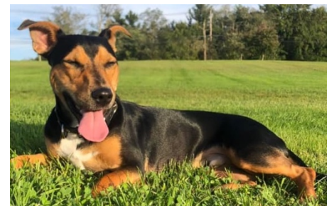
Crosby (one of Java's puppies)