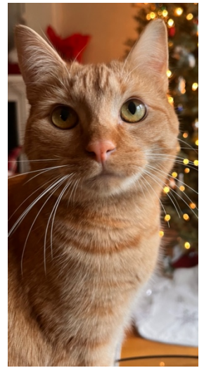
Shelby (formerly Apple)