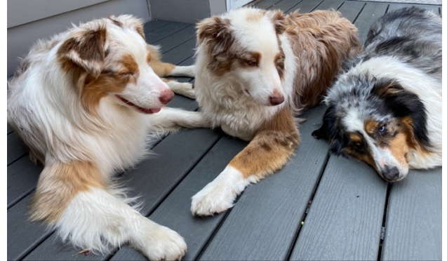
Nash (formerly Trix)