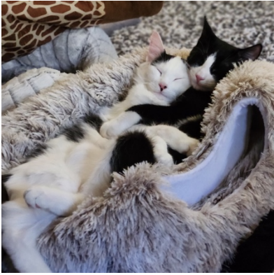
Taylor & Swift