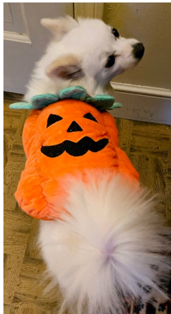
Pip (formerly O'Malley)